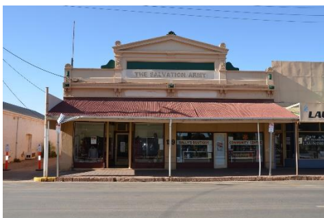
139-141 Main Street: Prior to commencement of the Main Street Project

The aim of the Main Street renewal project is to improve the overall visual appeal and utilisation of the Main Street while still maintaining the historical character and feel of the street. The renewal project will also further increase Peterborough’s appeal to tourists and hopefully entice them to stop, stay and spend and see all the exciting things Peterborough has to offer.