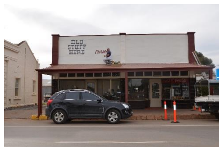
109-111 Main Street: Following building works, metal plate for signage to be installed