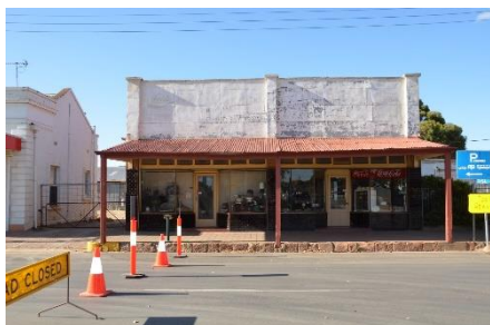
109-111 Main Street: Prior to commencement of the Main Street Project

Construction is ongoing and being undertaken by three local contractors Chambers Building Services, 4K Construction and John Schofield and Son. Say hello as you walk by!