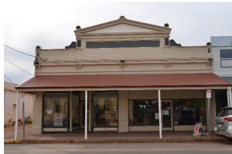
139-141 Main Street: Following building works, with metal plate for signage to be installed