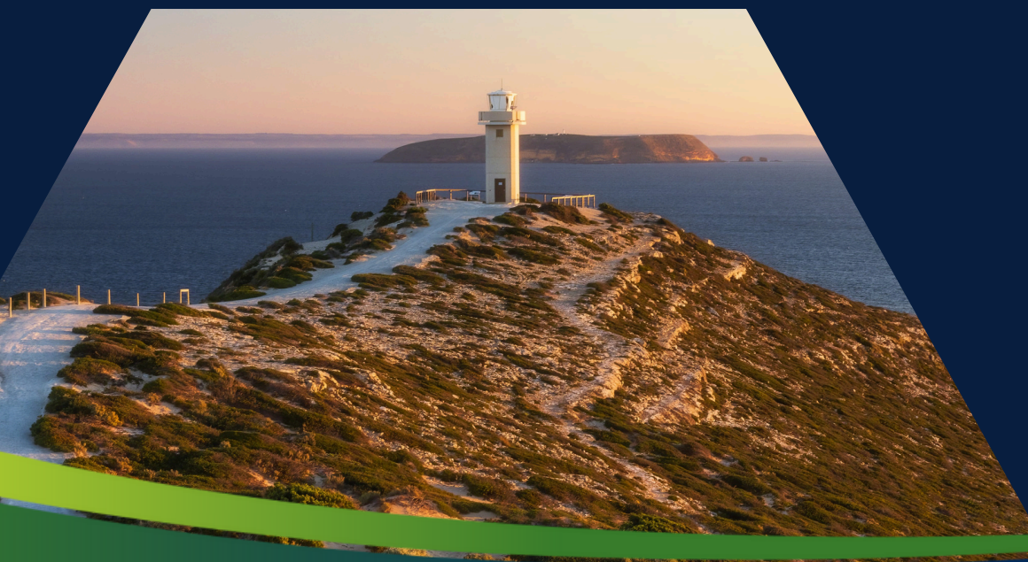
Corny Point Lighthouse

Produced by Regional Development Australia Yorke and Mid North - Approved: August 2025