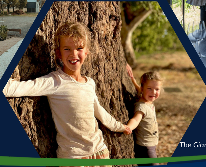
The Giant Red Gum Tree