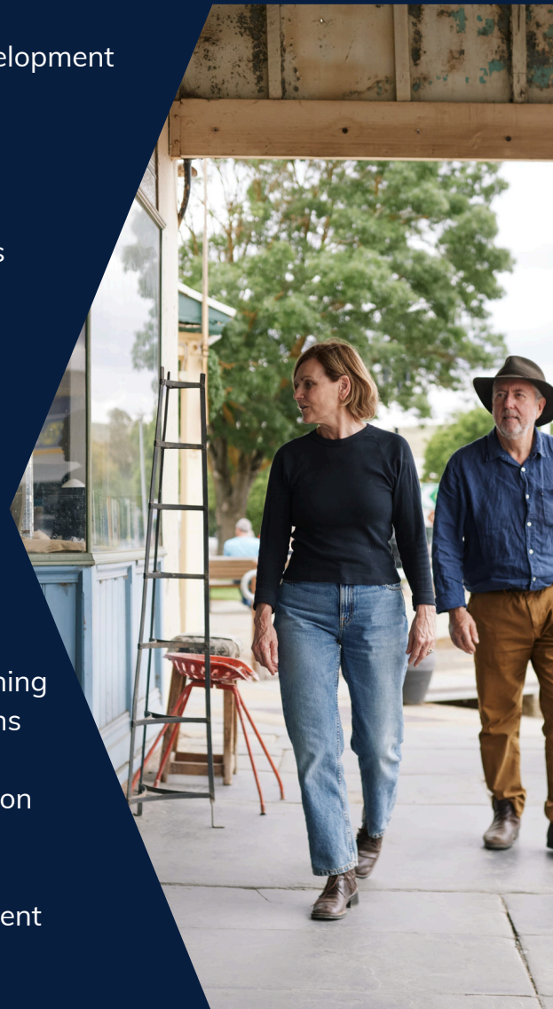
Waters Burra Bakery